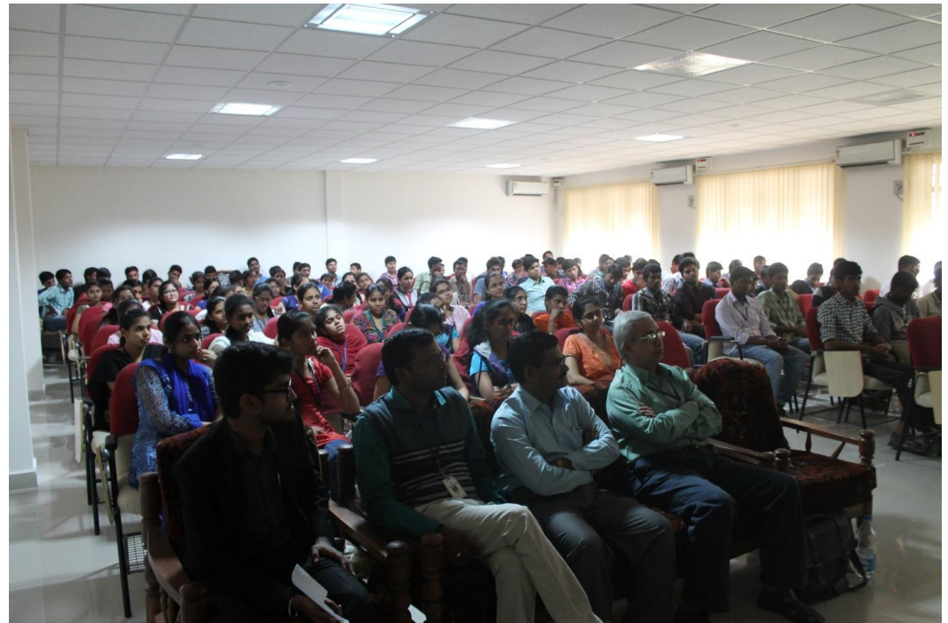
At the Matrusri Engineering College Campus